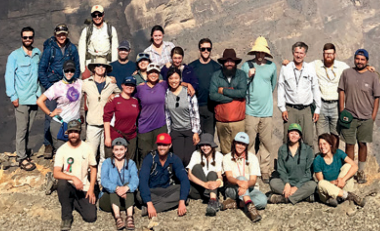
Grand Canyon of Oman.