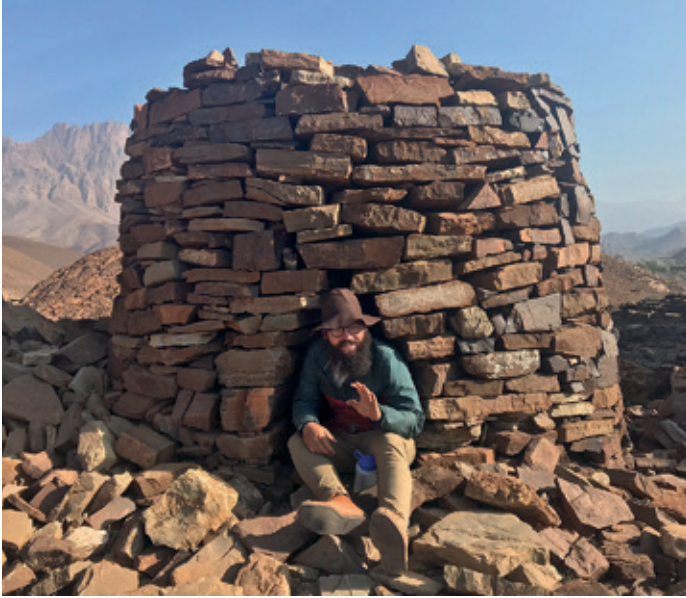
Oman