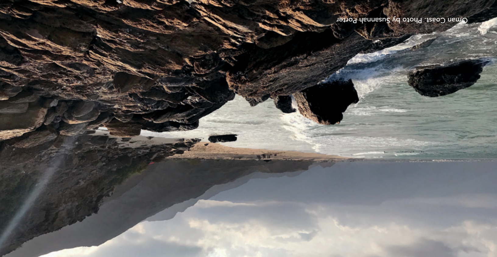
Oman Coast.

Department of Earth Science University of California, Santa Barbara 1006 Webb Hall Santa Barbara, CA 93106-9630