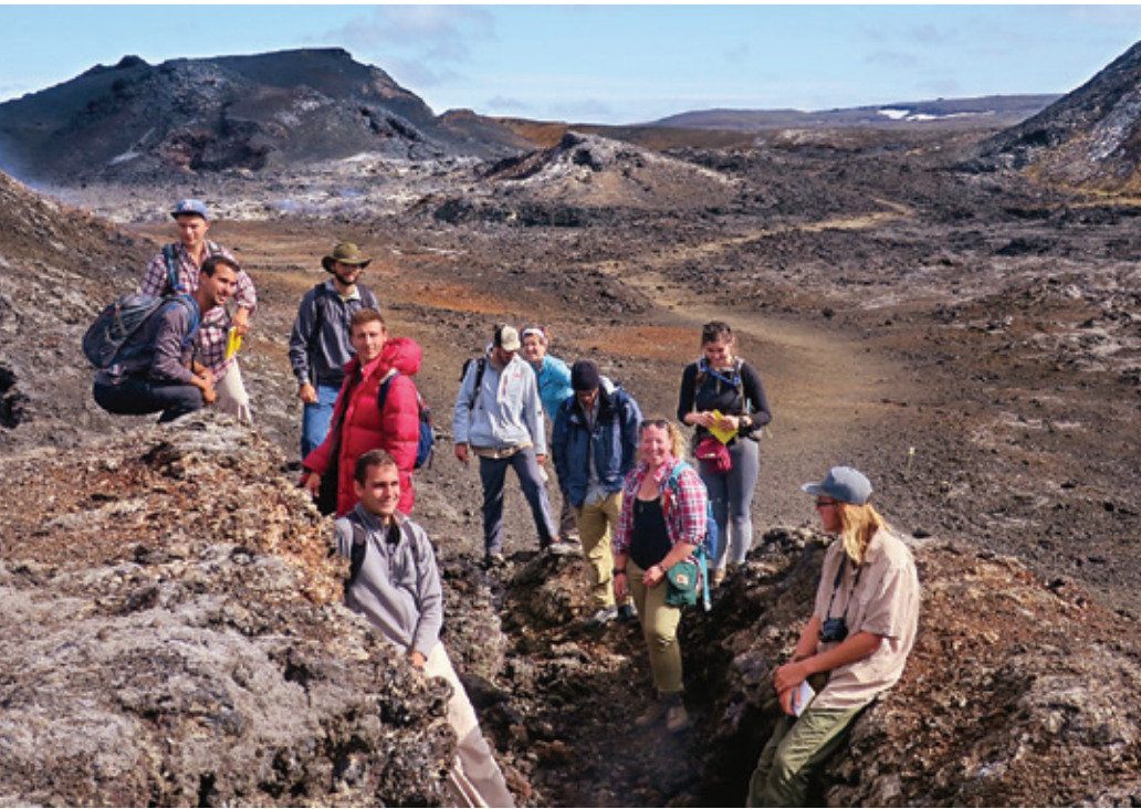
UCSB students standing in a portion of the 1984 Krafla fissure vent system, Iceland (above), and examining the 1875 fallout and surge deposits inside the Askja Caldera, Iceland (bottom right).

The 2016 edition of our capstone Summer Field course (Earth 118) was, by all accounts, a great success. Ten undergraduates completed the intensive six-week geologic mapping course under the incomparable guidance of professor Phil Gans. The first four weeks were situated in the Snake Range of eastern Nevada—a spectacular alpine mountain range. This range, with its famed low angle detachment fault, provides an ideal laboratory for students to hone their field skills in a broad spectrum of rock types. Field exercises included (a) preparing a detailed structure contour map of the detachment surface, (b) unraveling the geometry of extensional faulting of upper plate Paleozoic carbonate rocks, and (c) analyzing the strain history in lower plate tectonites. Students concluded