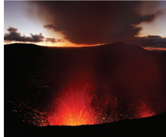
Long-exposure of a Strombolian explosion at Yasur during sunset.

Field days were spent digging holes for the seismometers, running cables through the jungle for the infrasound sensors, and observing and imaging the eruptions and